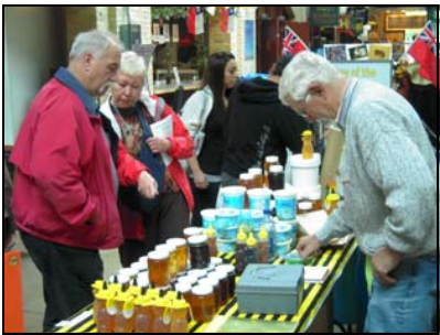
Visitors finding flavoured honey