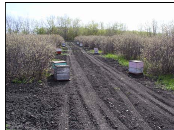
Fig. 1. Honey bee hives in saskatoon orchard in 2008.

FIRST YEAR (2008) - In the first year of the project, we worked with three saskatoon orchards, of Smokey variety, in the southern Interlake, Manitoba. The design was unreplicated. Each orchard received a separate treatment. Four plots, 20 metres long each, were randomly "embedded" within each orchard. Ribbons were tied to six branches in each plot, three branches per plot side. Honey bee hives were put in two of the orchards late in the evening and into the early morning on May 28, 2008 (Fig. 1). Brood pheromone was put in all the hives at one of the sites.