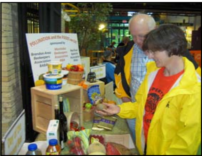
Guests liked various foods on display

To honor the Honey Bee, their importance to the agricultural community, contribution to the provincial economy, environmental friendly impact, plus their contribution to our food supply, and our need to protect them, several events took place. The main focus was a table arrayed with foods from plants requiring pollination (i.e. Sunflower, Raspberry, Pumpkins, Canola (oil), Cucumbers, Tomatoes, Apples, Watermelon, Kiwi, etc). Other features included a pollination pictorial collage, an interactive display of live bees, and colorful floral specific honey and other hive products. In addition, media coverage took place on CBC Radio, City TV and an article in the Manitoba Cooperator newspaper.