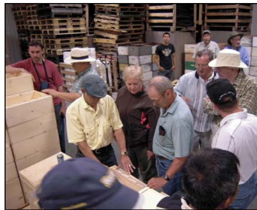
Guests enjoy the new feeder design.

plish. In another area of the facility, Paul's helpers were busy explaining the design features of their new hive-top feeders under construction.