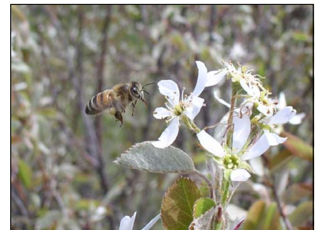
Fig. 2. A honey bee flying to a saskatoon flower with saskatoon pollen in its pollen baskets.

In both years, flower visits (Fig. 2) from about 0-10 honey bees per 20 metre row plot ranged, or up to 0.5 honey bees per metre. This appears to be relatively low. For blueberries, for example, 2 honey bees per metre of row is considered satisfactory (Rhodes 2006). The bees were collecting pollen, but it's unclear if nectar was collected.