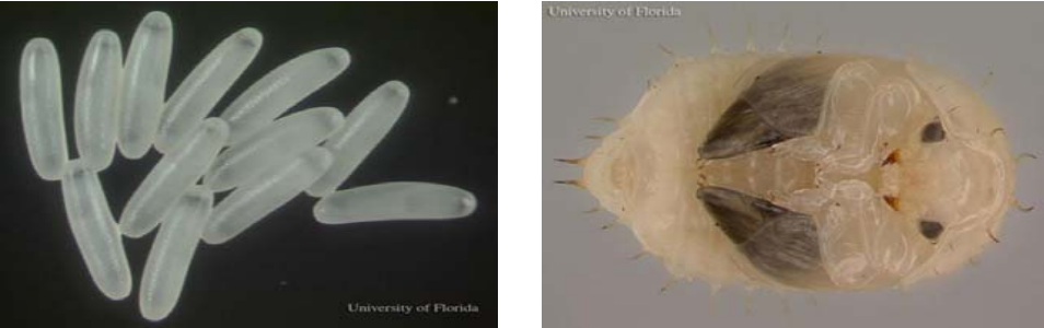
Figure 3. Eggs and pupa of a female small hive beetle, Aethina tumida Murray. Small hive beetle Eggs are typically 2/3 the size of a honey bee egg, white and elongated and typically laid in clusters. Early-stage pupae start off white and have projections on the thorax and abdomen. Later-stage pupae darken from tan to brown as their exoskeleton develops and hardens.