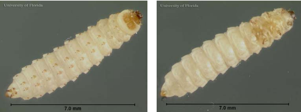
Figure 2. Dorsal and ventral view of a small hive beetle, Aethina tumida Murray larva. Larvae range in size from a 2 mm to 11 mm in length and white to tan in colour with a dark tan head, forked process at the hind end, and three pairs of legs.