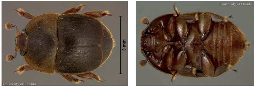
Figure 1. Dorsal and ventral view of an adult small hive beetle, Aethina tumida Murray. Adult SHB are 5.5- 5.7mm in length, 3.2 mm in width, dark brown almost black, round, with clubbed antennae (i.e. the last three segments of the antennae larger than the previous ones). The body is covered with hard, short wings (elytra) that don't cover the full length of body, thereby exposing a small part of the dorsal side of the abdomen.